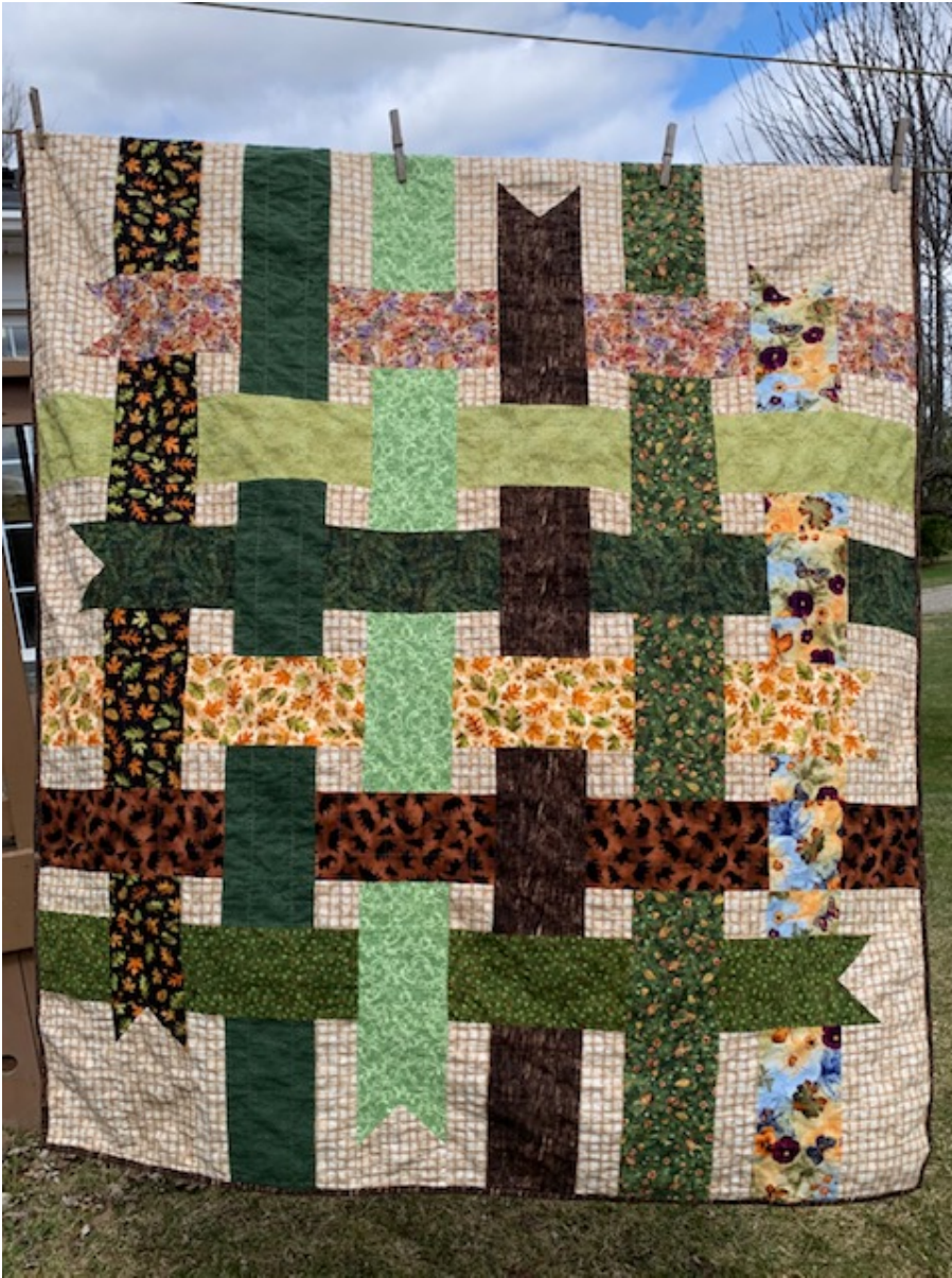
Summer Mystery #3