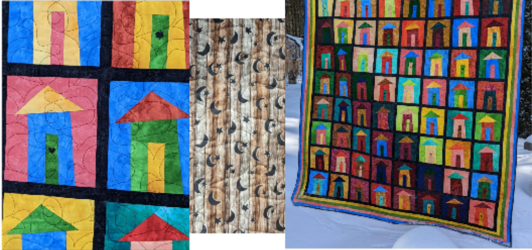
Sherry Friskney - Outhouses