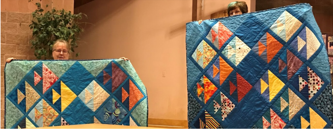
Completed BOM quilts for Community Outreach.