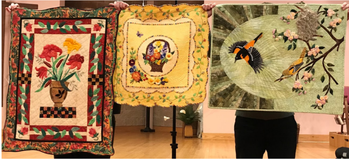
Nancy Wells - examples of hand applique and hand quilting "Lilies with a Touch of Gold", "Spring Bouquet", "Spring is in the Air Spring is Everywhere"