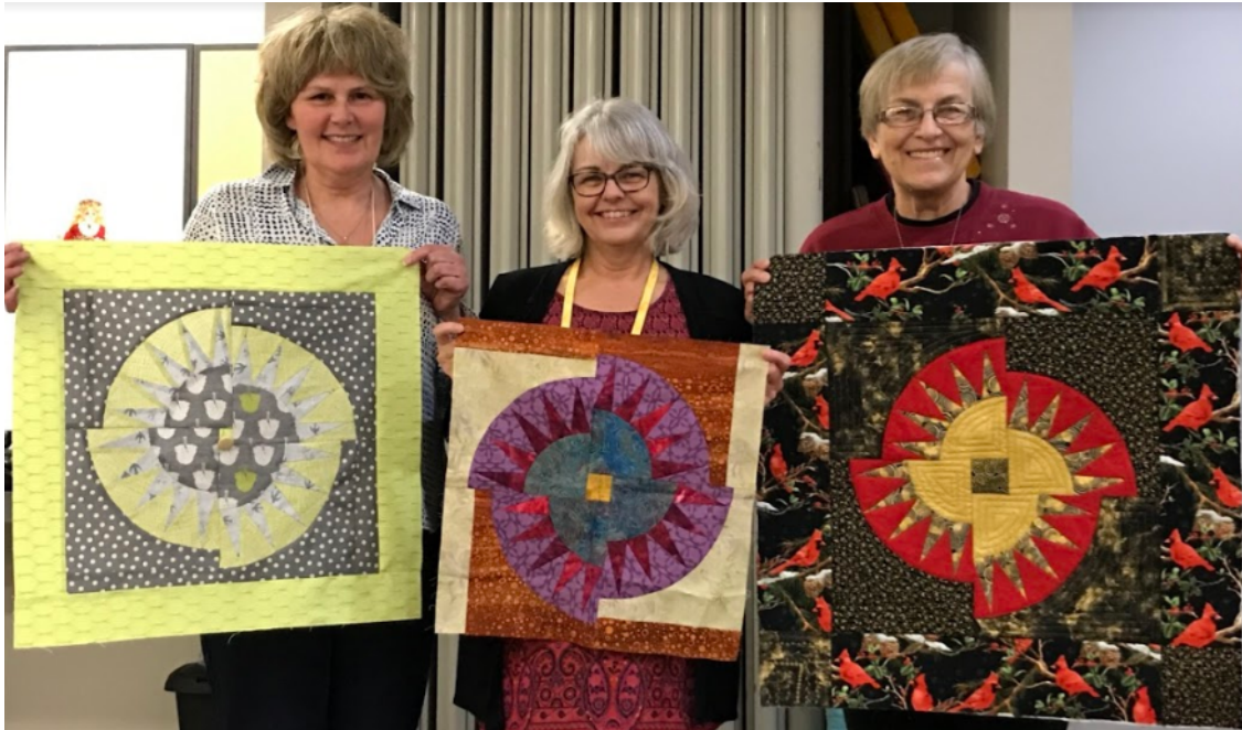
Three beautiful finishes from the "Painless Paper Piecing" workshop.