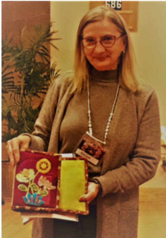
Nellie Hanuta: English Garden Needle Roll, adapted from Sue Spargo Fresh Cut Pattern