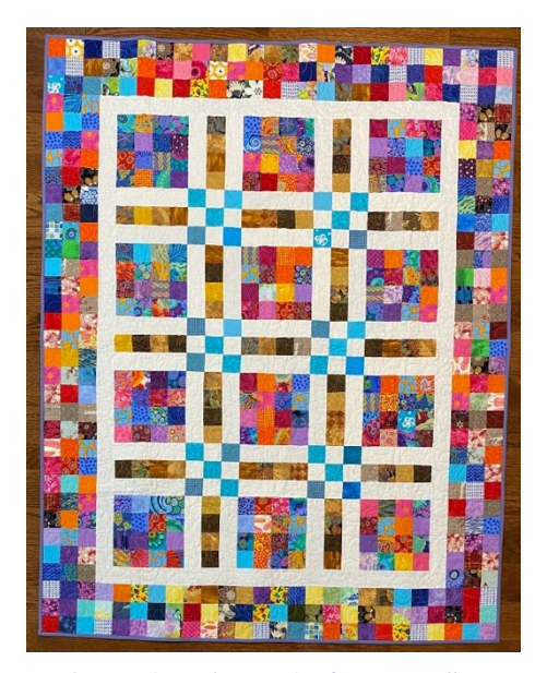
Hospital-sized quilt made from 2.5" squares

You can make this project from your collection of squares, or strip piece it for a faster finish. Add a bit of background fabric (an assortment of scrappy backgrounds is fine) to showcase your strips and strings. Would you like to sew from the Guild stash to make a donation quilt? Let Becky or Ann know as soon as possible.