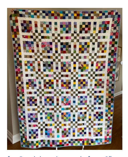
Home for Good donation made from 2" squares

Stash Busters meets via Zoom from 10 am to 2 pm Eastern on the first Wednesday of the month – all year long! Virtual doors open at 9:30 am. Participation in the group is free and we welcome new participants at any time. There is no charge to participate. Please contact stashbusters [at]royalcityquiltersguild.ca to be added to the mailing list or learn more about this friendly group.