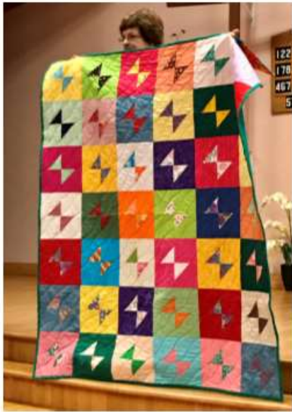
BOM Comfort Quilt from September.